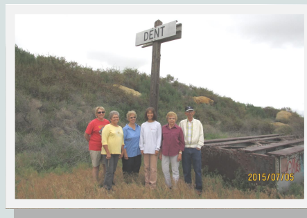
Visit to Dent, Colorado

Whether to help plan, volunteer at events, build the museum, or support us monetarily, we welcome you!